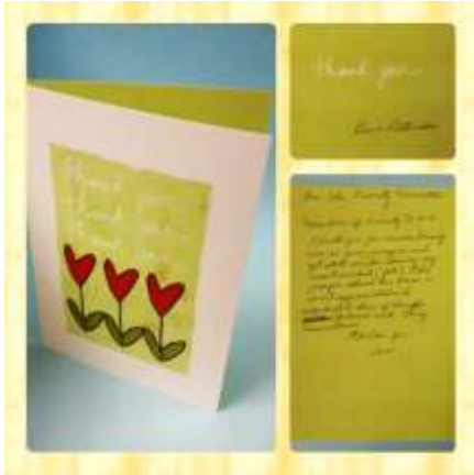
A Note of Thanks!

The 2016 VBS Mission in part was to raise funds in support of the NO Cheese Sandwich Campaign . The Children were eager to help their community and their friends and did a great job raising funds!!! The funds raised were disbursed to the school but have already been depleted. Hunger HURTS! Hunger is LOCAL! YOU CAN HELP!! Please consider supporting the Children's Ministry as it works to support this school and its hungry students. Donations can be placed in the offering plate and labeled SALEM . The Children's Ministry challenges everyone to donate the price of one fast food meal in support of this mission. The price of one drive thru lunch or dinner can feed 3 elementary students. Food for thought!!!