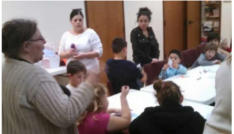
Making snowflakes and learning how God made no 2 flakes are alike just like us!

We will have snacks, games and make Valentine's for our shut-ins.