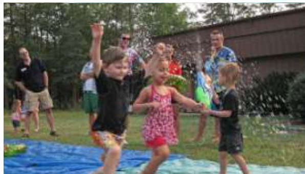
The water slide at VBS is one of the first picture from the summer of 2010