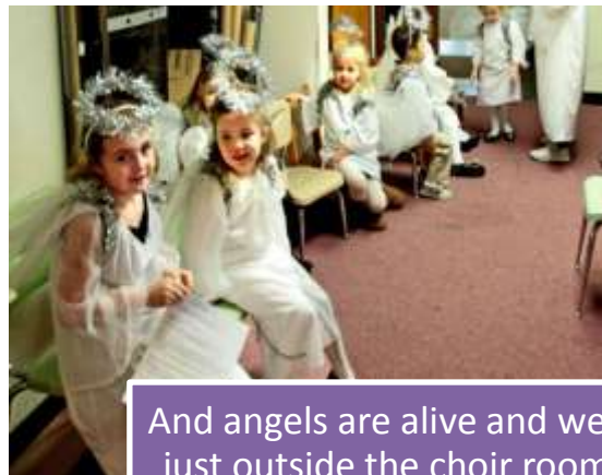
And angels are alive and well just outside the choir room